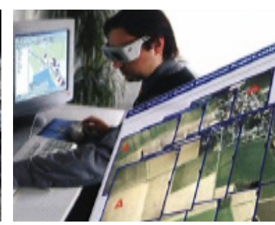
Hydrography and Oceanology